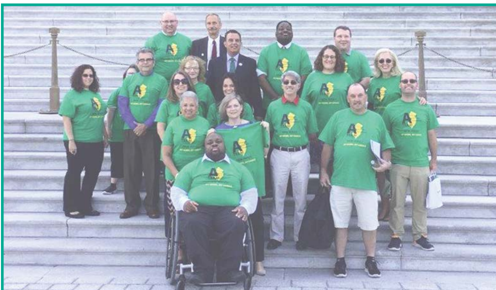
A large part of our group enjoyed a tour of the Capitol and then stopped for this shot on the Capitol steps.