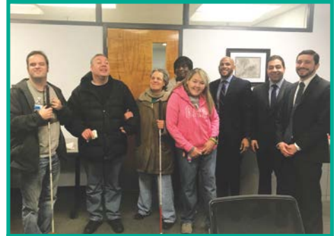
Aides to Senator Cory Booker (three at right) and program participants at Inroads tour.

Because of organized opposition to the work center model, including some in Congress, Inroads believes it is vital for them to defend it as an option for people with disabilities who need the support to maintain employment. If this option is eliminated, tens of thousands of workers with disabilities across New Jersey will be unemployed. Inroads is optimistic that Senator Booker’s team will be able to report a fresh perspective on this subject, which will be key when decisions are made regarding upcoming legislation.