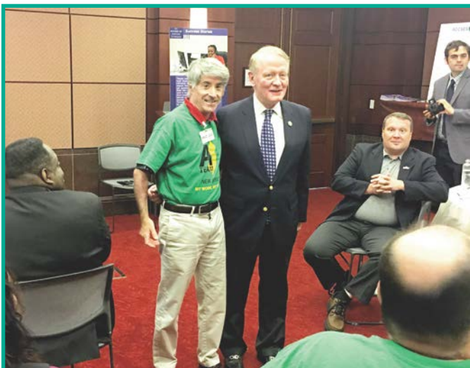
Congressman Lance (standing center) addressed our group after announcing support for HR 5658.